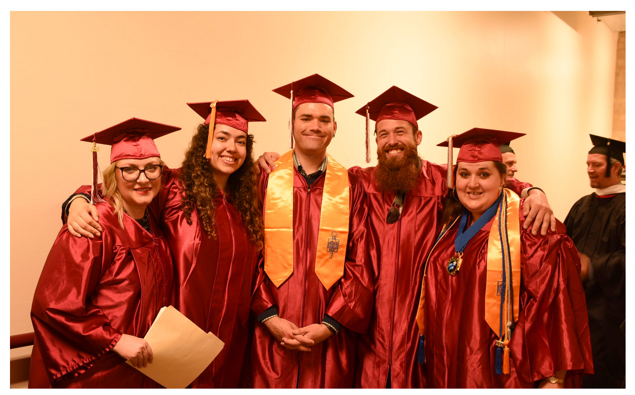
SOME OF OUR EXCEPTIONAL SCHOLARS

The Red Rocks Community College Foundation was founded in 1991 with the mission to remove the financial barrier and help students of all income levels access the high quality, high impact, education provided at Red Rocks Community College.