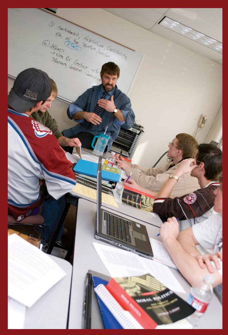
Last Fall, the RRCC Foundation Office implemented a new Adjunct Tuition Reimbursement Program. The emphasis was to support RRCC Adjunct Faculty who wish to extend their knowledge and enhance their teaching capacity. The program has given support to 19 Adjunct Faculty members, with a total of $9,540 in tuition reimbursement.