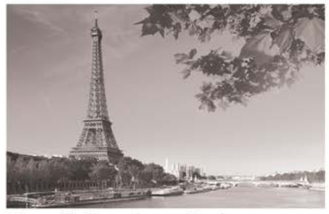
May 25th - June 3rd

ENG 221 - Creative Writing I (3 credits) Instructor: Paul.Gallagher@rrcc.edu